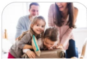
Summer Holiday Packing Checklist for Children