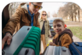
Pre-Holiday Family Checklist

young people's wellbeing, learning and development.