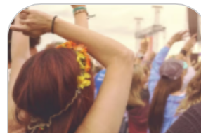
Festival Packing List for Teens