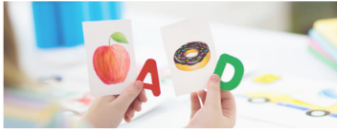
Why Phonics Matters