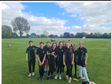
U13 Girls Cricket Team