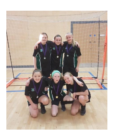
Girls U12 Futsal Team